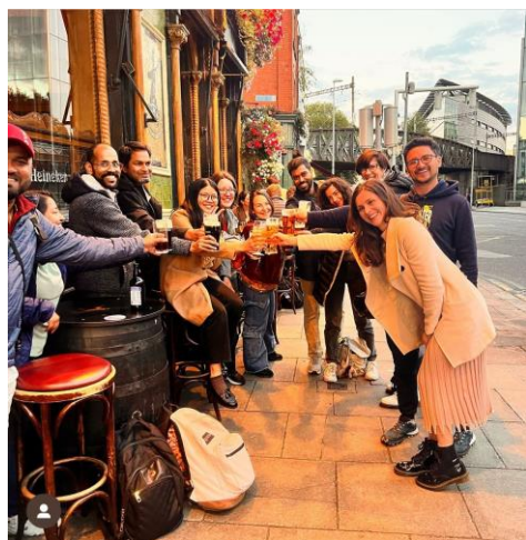
Cheers from a recent social gathering of the TRSA network!